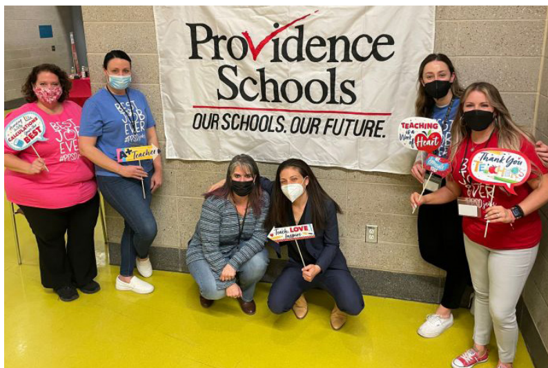
Human Resources hosted Career Fairs this spring like this one at Providence Career and Technical Academy.