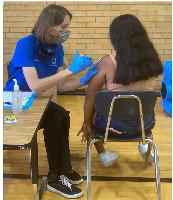
COVID-19 Vaccination Clinic at Gilbert Stuart Middle School in August 2021.