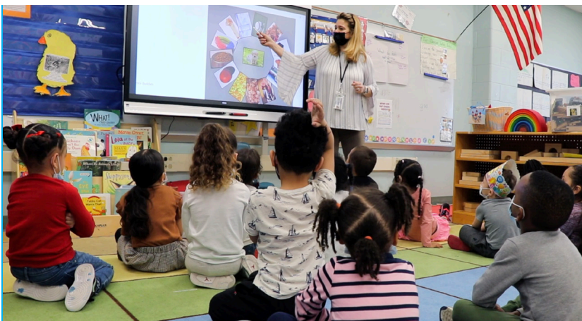
Students learn during a Pre-K class at Young Woods Elementary School this spring.