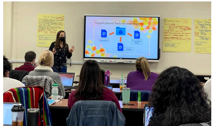
A coaching retreat for leaders at Providence Public Schools.