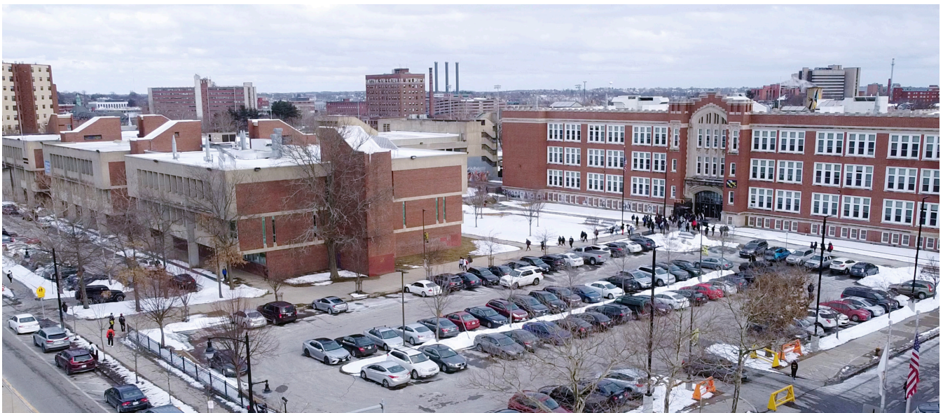
Classical High School, left, where renovations are in progress through Phase I ESSER funds.