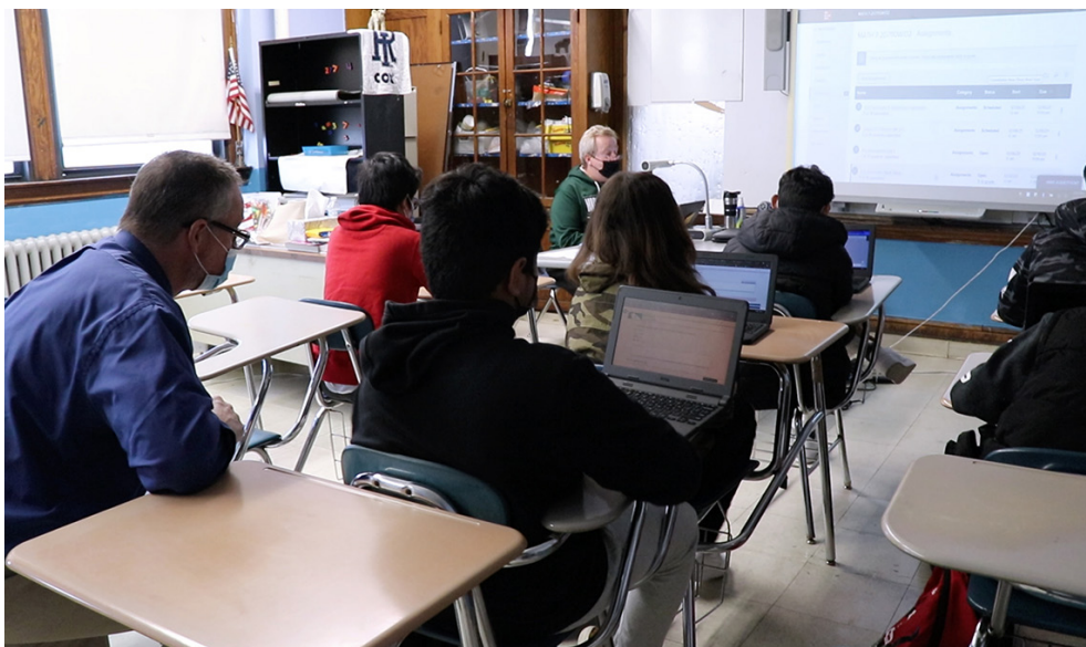
A learning walk with classroom visits by instructional coaches and district leaders at Providence Public Schools.