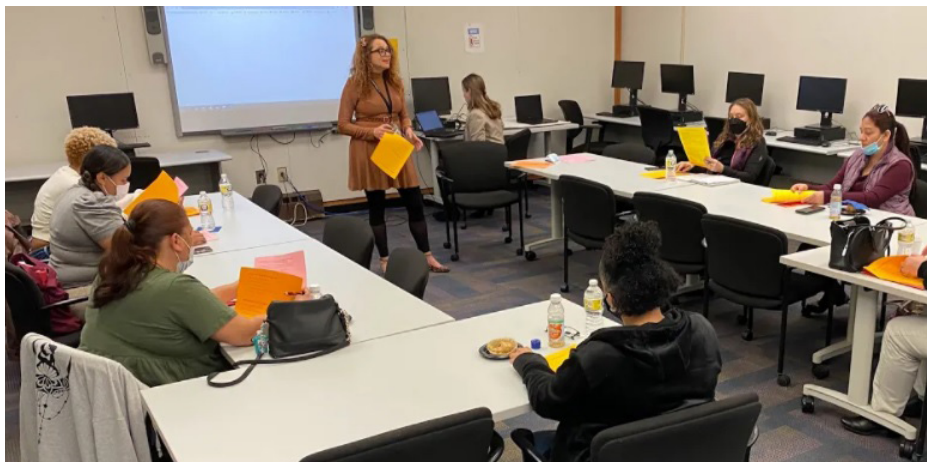
The Parent Ambassador Program provides valuable feedback to PPSD leadership.